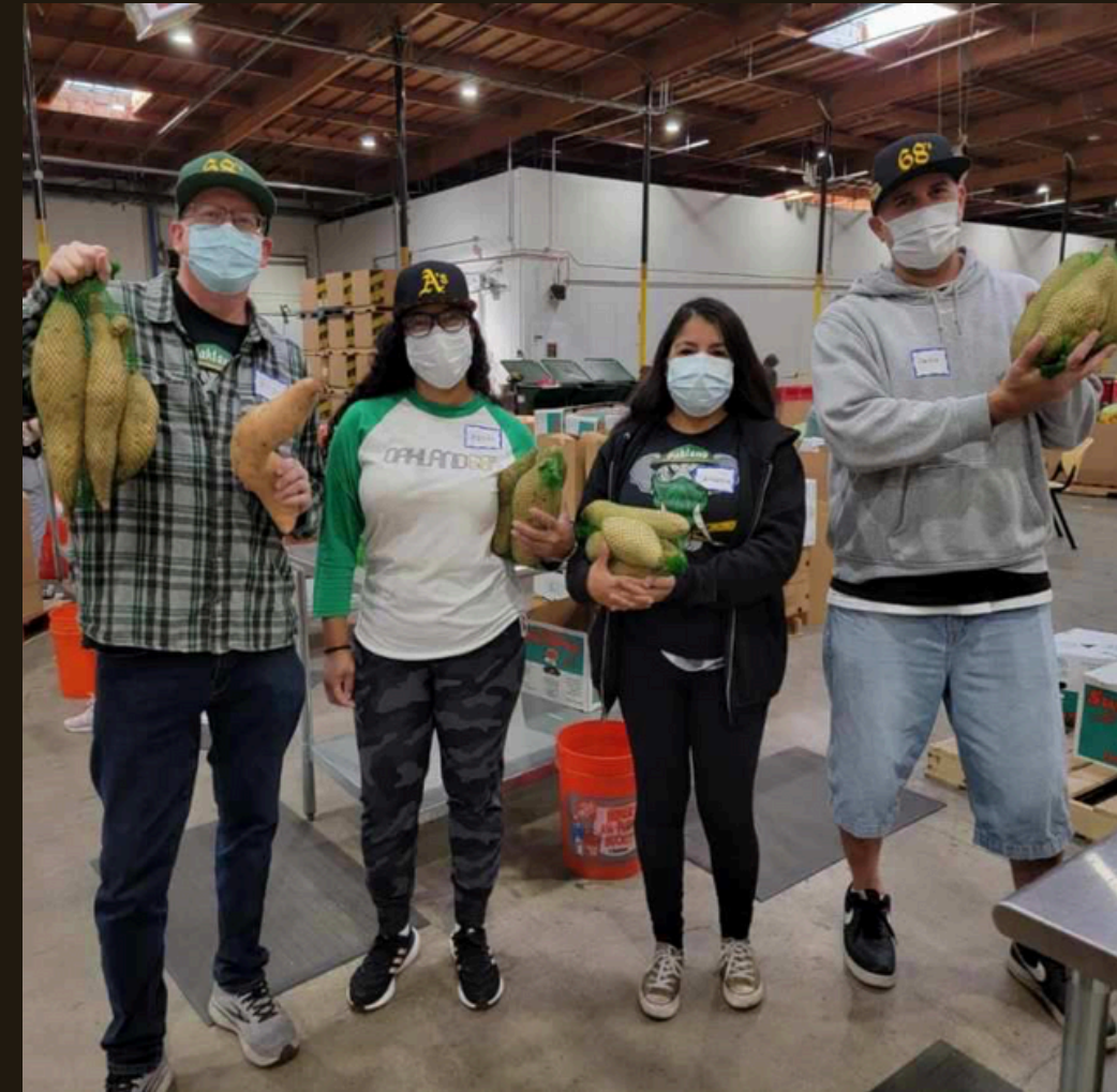
OAKLAND 68'S MEMBERS

Being a community-first supporters' group means we've dedicated over 1,000 volunteer hours in Oakland. We partner with organizations like the Alameda County Food Bank, local homeless shelters, and the Oakland Athletic League to make a tangible difference. We invite you to join us in our mission to uplift Oakland's rich sports culture and create lasting social impact.